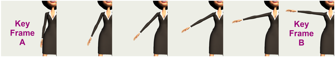
Figure 1: In the Animator, the user defines only key frames A and B, and the system interpolates between those two key frames to create the in-between frames, as the image illustrates. Note that this is a simplified view: in reality, there would normally be 58 in-between frames, not 4.