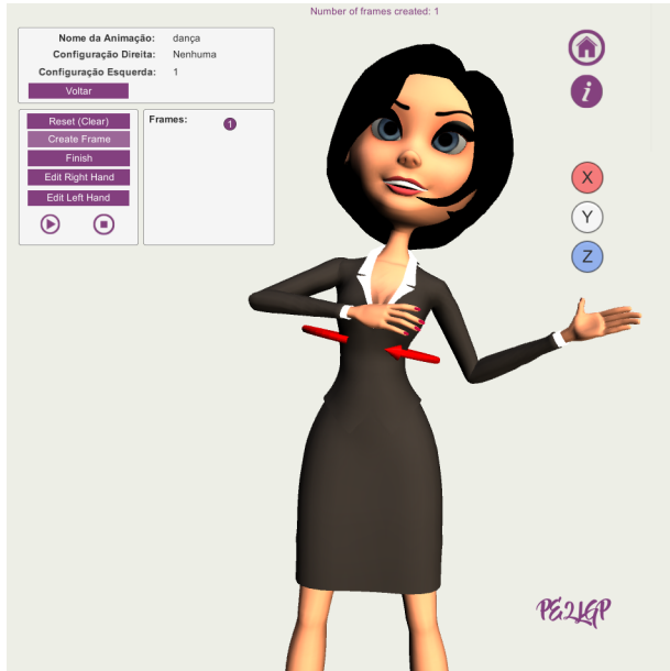
Figure 2: Screenshot of the Animator. Notice the red hoop around the avatar’s waist, indicating the selected joint and how it will rotate. On the right, you can see the X, Y, and Z buttons, which control which axis is to be rotated. On the left, there are various controls, such as for creating new frames, switching hand poses, and previewing the animation.

(which occurs within an animation ) and transitions between two animations . The former occurs in the Animator, when the sign is created, while the latter is done in Unity’s animation controller.