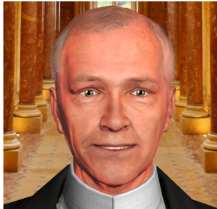
Figure 3: The EDGAR character in a joyful state.

Emotions are declared in the knowledge sources of the agent. As shown in Figure 3, they are coordinated with viseme animations.