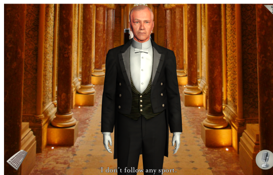
Figure 1: EDGAR at MONSERRATE.