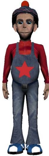
Fig. 1. Papous: the storyteller

inspiration in children’s characters such as the Tweenies TM [21] series). Figure 1 shows the character created.